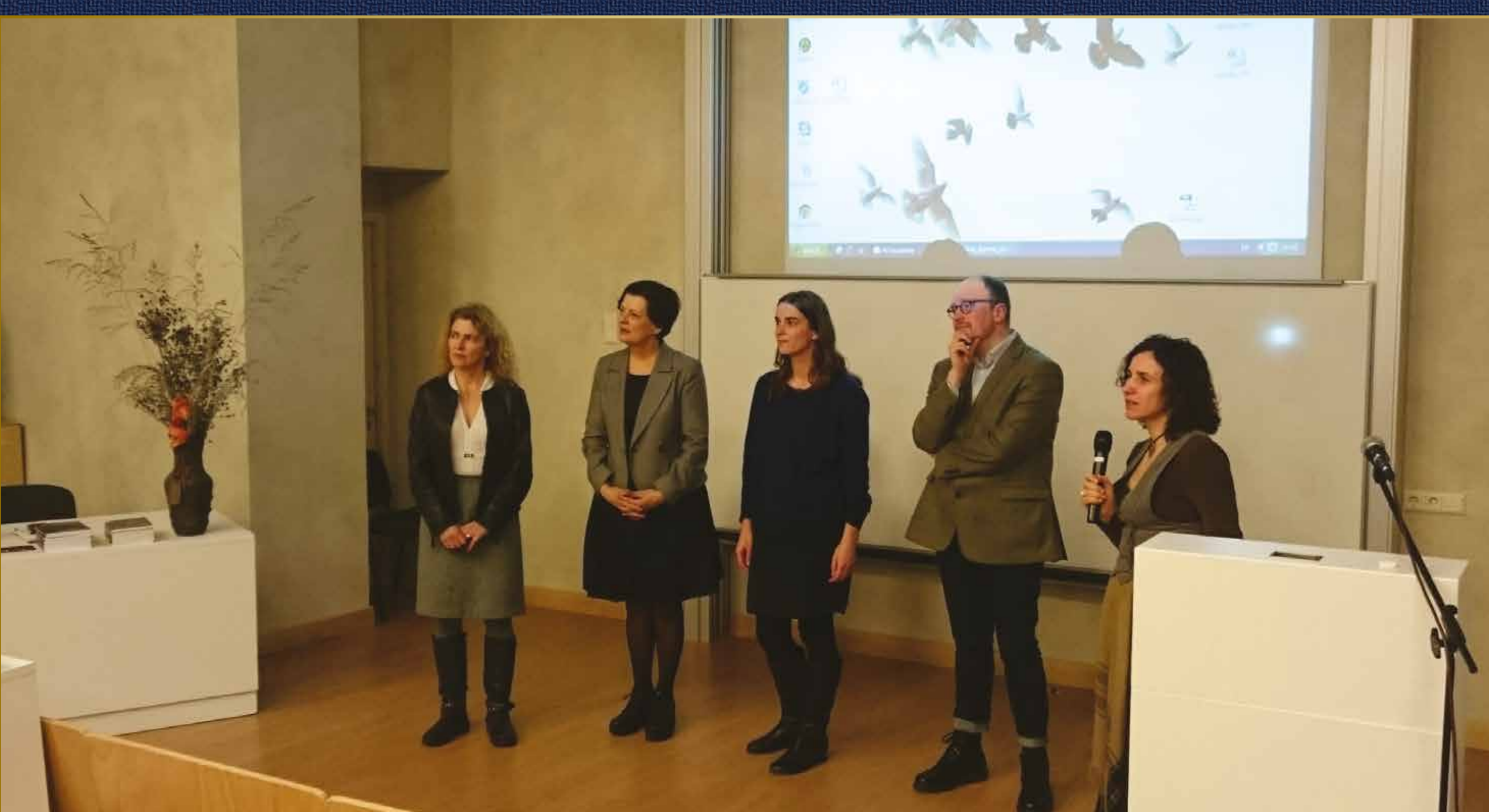
Key researchers at the seminar "Gender and Feminist Research Methodology" in Rezekne Academy of Technologies, February 11, 2016.