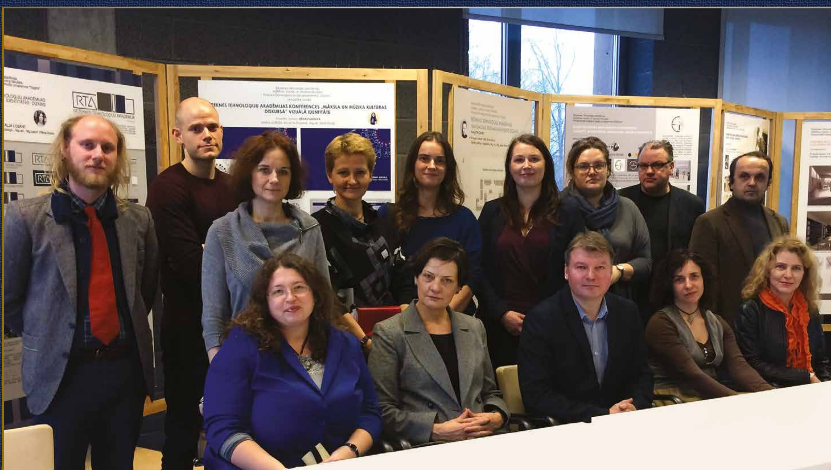
Representatives of all partner institutions at the seminar "Gender and Feminist Research Methodology" in Rezekne Academy of Technologies on February 11, 2016.